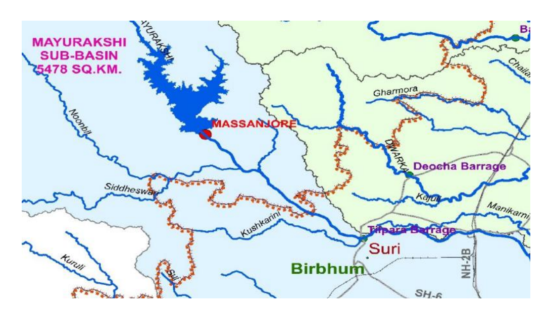
Fig 2:Mayurakshi river and its tributary at upstream of barrage