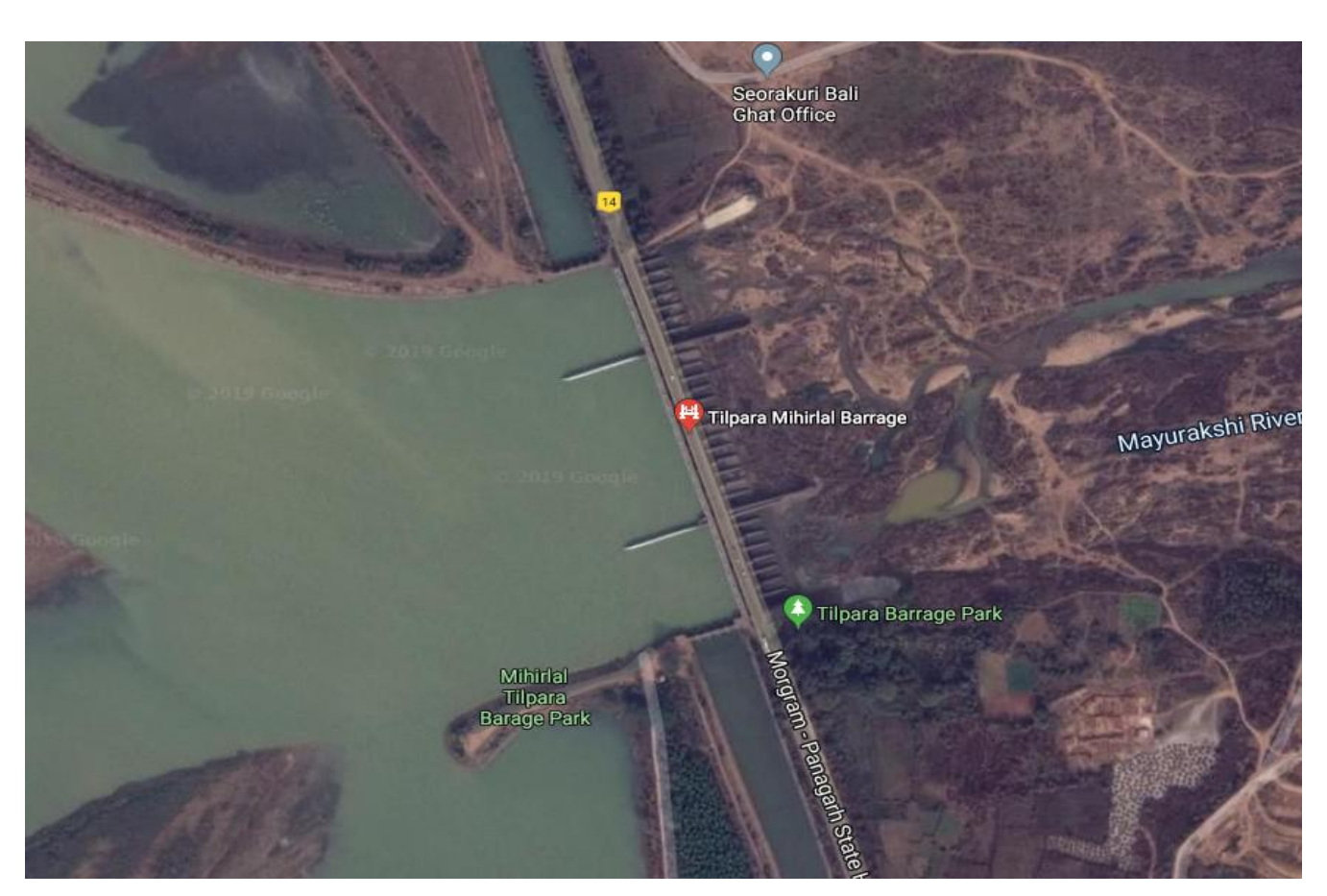
Fig 1:TilparaMihirlalBarrage and Head Regulators on left and right bank.

Tilpara MihirLal Barrage is constructed on Mayurakashi River. Its Construction was completed in 1956. There are 8 Nos. under sluice gates and 7 Nos. Spillway gates in this Barrage. Two main canals are constructed on right side Mayurakshi Dwarka Main canal (MDMC) and on left side Mayurakshi Bakreswar Main Canal (MBMC) for the purpose of irrigation.